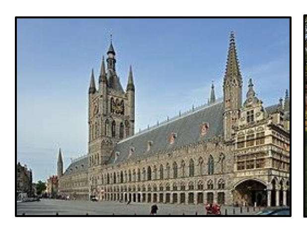
Cloth Hall, Ypres

The breathtaking memorial took over eleven years to build. It was unveiled on July 26, 1936. It was rededicated on April 9, 2007 at a ceremony commemorating the 90th anniversary of the battle.