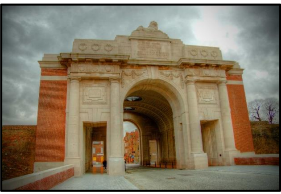
Menin Gate, Ypres