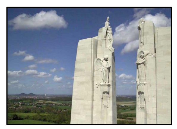
VIMY VIMY Monument