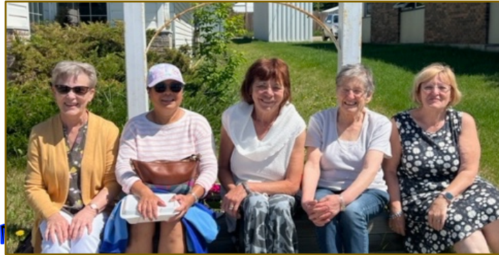
Something was very funny ... just can't remember what it was.