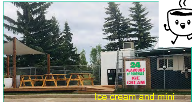
Ice cream and mini