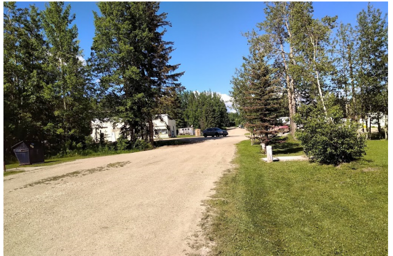
Early summer pictures, 2019

ARTA supports an engaged lifestyle after retirement through member-centered services, advocacy, communication, wellness, and leadership.