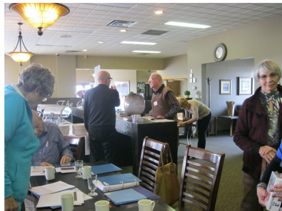
Photos from HARTA's first Mini-Conference, April 15, 2014

ARTA supports an engaged lifestyle after retirement through member-centered services, advocacy, communication, wellness, and leadership.