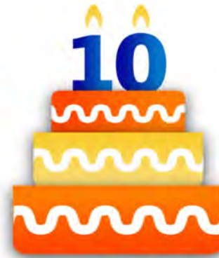
Celebrating HARTA's 10th Year as a Branch of ARTA

HARTA's Presentation will be held on Thursday, April 14th, on Zoom. The presentation information will be forwarded when available.