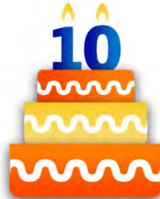
Celebrating HARTA's 10th Year as a Branch of ARTA