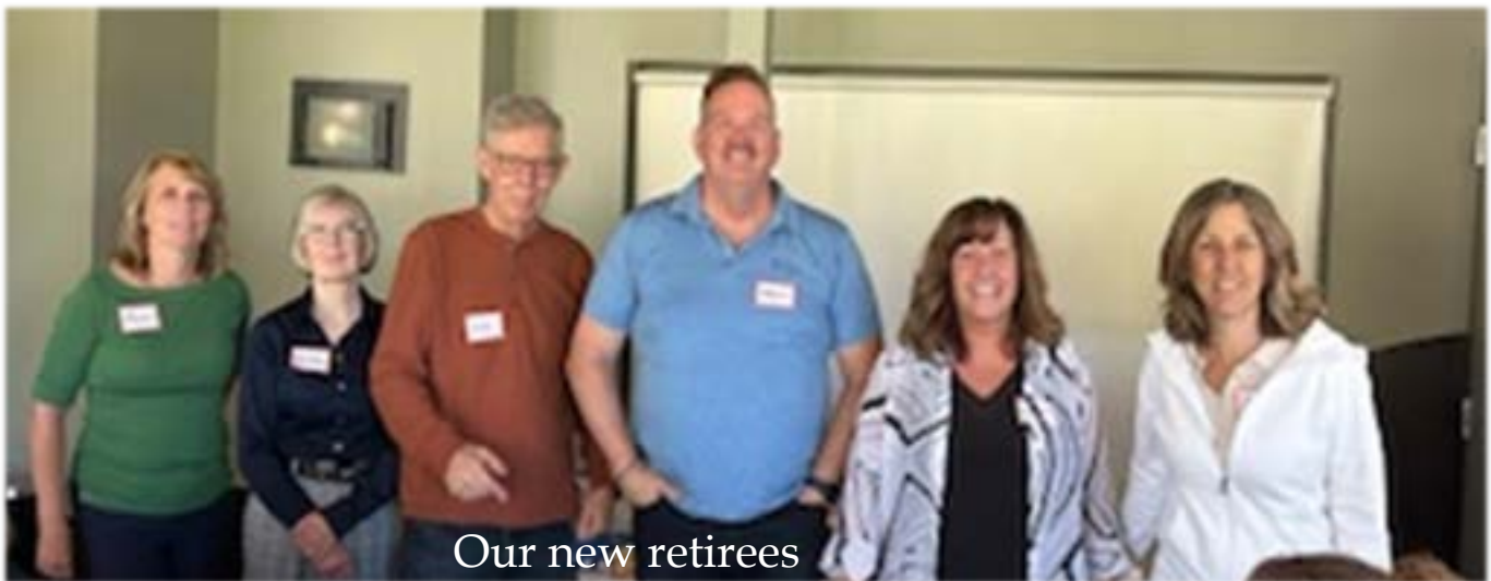
Our new retirees